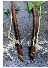
At the nodes