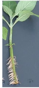
In the internodes