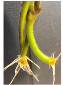
At the cut ends